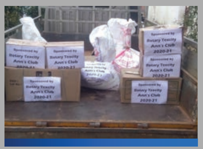
Anns of our club donated groceries worth Rs. 16000 to St. Thomas Orphanage, Coimbatore and Mahatma Karunai illam , Coimbatore.