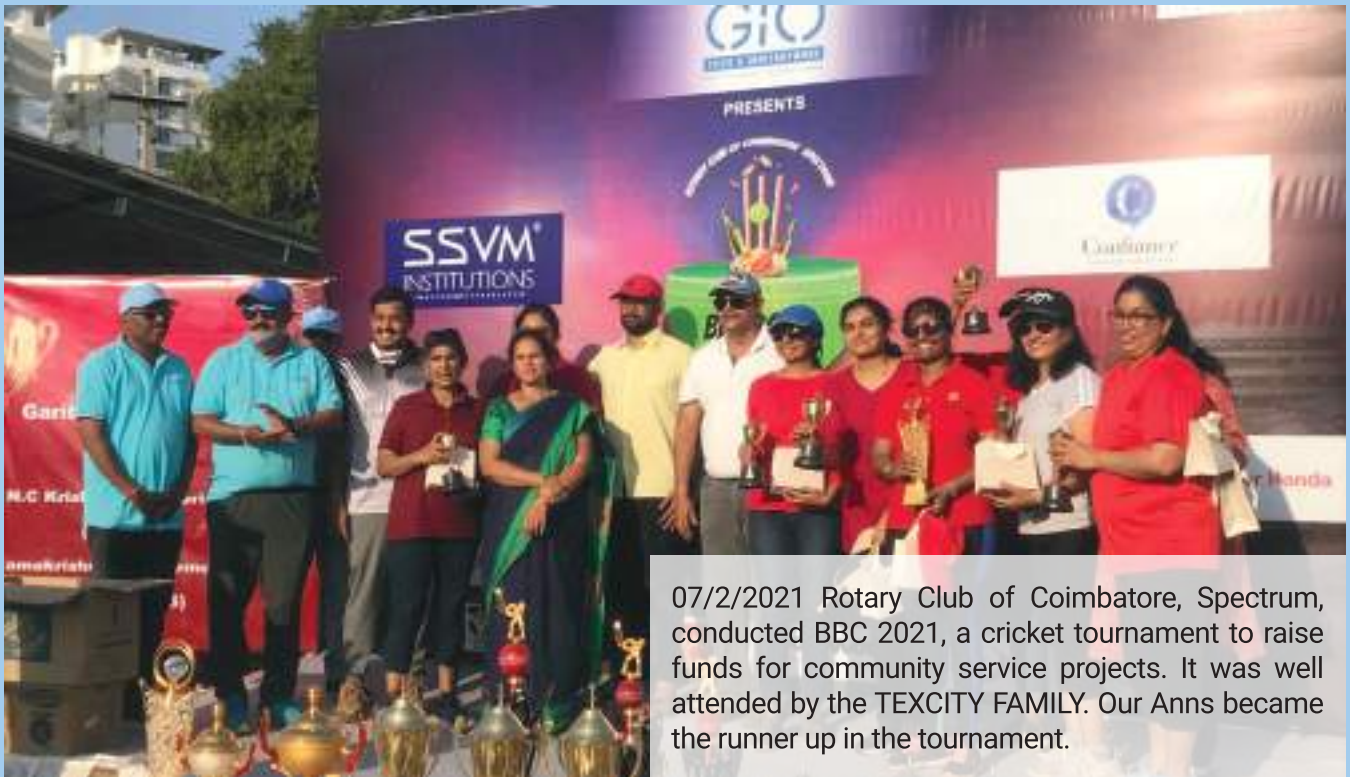
07/2/2021 Rotary Club of Coimbatore, Spectrum, conducted BBC 2021, a cricket tournament to raise funds for community service projects. It was well attended by the TEXCITY FAMILY. Our Anns became the runner up in the tournament.