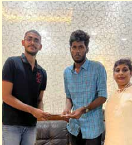
Support for education given by Ann's Club & Annet's Club