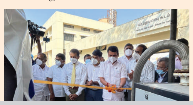
Inaugurated by Shri. V. Senthil Balaji, Minister of State, Electricity & Prohibition and Excise