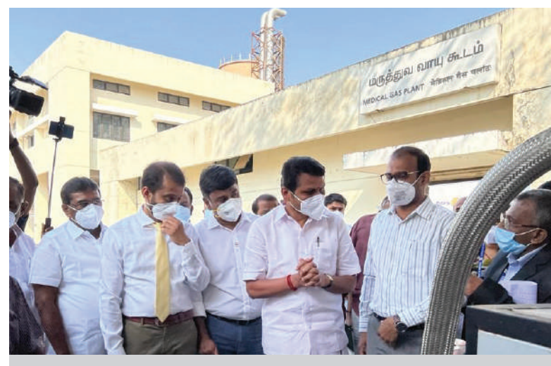
Dr. Sameeran, District Collector, Coimbatore during inauguration with Shri. V. Senthil Balaji, Minister of State.