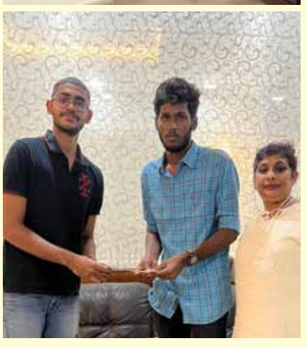
Support for education given by Ann's Club & Annet's Club